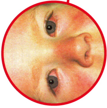
Red, bloodshot eyes