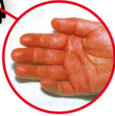
Red, swollen hands