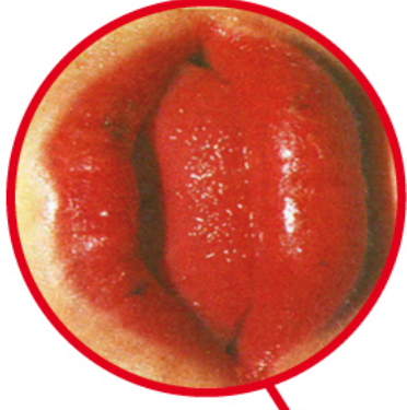
Red, cracked lips and red tongue