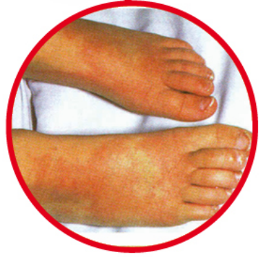
Red, swollen feet